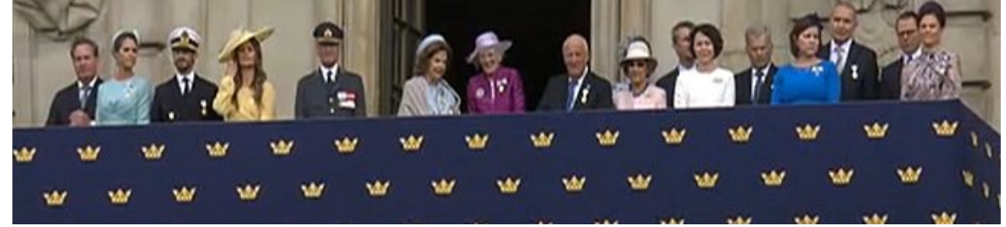
All Nordic chiefs of state, spouses and some princes/princesses on the courtyard balcony. Four cheers!

history. Sweden has been a monarchy always. The first king to rule the two main historical tribes of the country, and thus in a way representing all of Sweden, was Olof Skötkonung ("Olaf the Swede" https://en.wikipedia.org/wiki/Olof Sk%C3%B6tkonung) crowned in 995. This is a history of more than a thousand years, at a time when the Vikings still roamed the seas. (The Swedish vikings roamed the eastern rivers, to Ukraine and Constantinople, contributing to founding Kyivrus, giving the name "Rus" to Russia). The monarchy is in important connection to history.