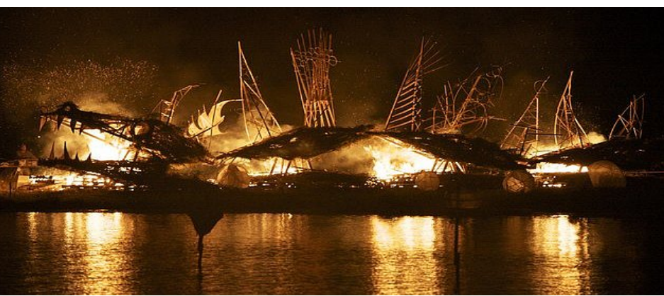
The Fire of Stockholm festival, Wisconsin. Looks wild!

town." Tons of establishments among 66 inhabitants? They every summer