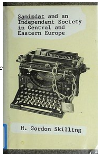
the Soviet bloc.

But samizdat wasn't unique for the USSR, but existed in all former Soviet bloc countries and republics. That is covered in H Gordon Skilling's Samizdat and an independent society in Central and Eastern Europe from <a href="https://annas-ruge">https://annas-ruge</a> archive.org/md5/1ed65f3dcf94e7ab11523b9daeffa3cb Here's a short lecture of samizdat: <a href="https://www.youtube.com/watch?v=AfPehnTLoOU">https://www.youtube.com/watch?v=AfPehnTLoOU</a> and a short film with samizdat production re-enactment: https://www.youtube.com/watch? v=uD 2ehs3gF0, in this case doing banned religious texts. Today's Rusia has On samizdat from other parts of instead allied with the corrupt Russian-Orthodox church, lead by former KGB