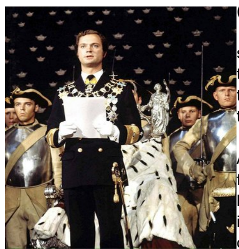
The King opened the parliament once under the old constitution. In background Charles XI's Drabant Corps.

Yes, there is an actual physical throne he could sit on. But only once! A new constitution came into effect 1975 to remove the king's remaining formal power (not used and irrelevant), but before that that king could at least once open the parliament the old way: sitting on the silver throne in the Hall of the Realm in the Royal Palace, reading the government's declaration after the Charles XI storm troopers had marched in. The British king still does that, but our monarch now opens the parliament from the ordinary tribune of the Riksdag and the prime minister reads the government declaration.