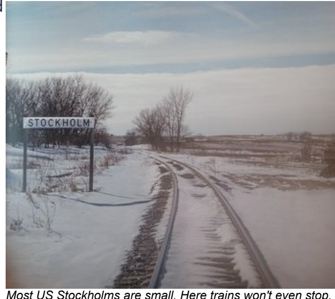
Most US Stockholms are small. Here trains won't even stop.

in the UK too, but there are none. Britain wasn't settled by 19th Century Swedes. However, it did take quite a lot of 10th Century Vikings, and all British towns ending in -by and -thorpe were named by the Vikings. And the Vikings called the town of York Jorvik. If it had kept that name, it's