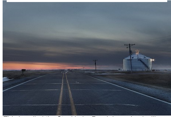
This is called the Stockholm Road, Iowa. Looks like farmland. The building right must be for grain storage.