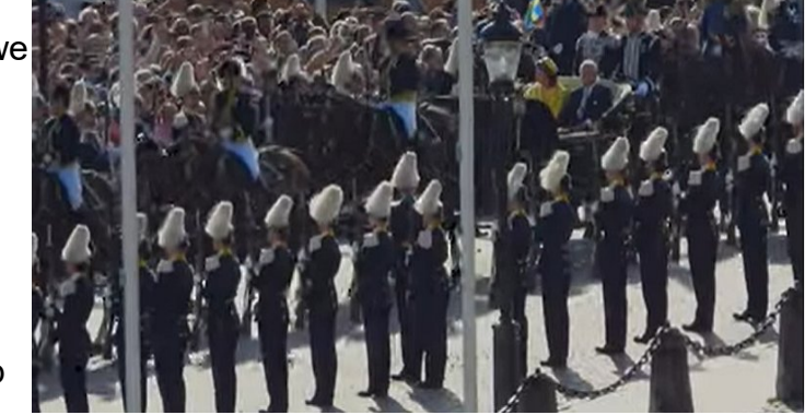
Royal couple in carriage through town, using lots of horse powers.

presidents gathered in Stockholm. (The UK was represented on a lower level. It was explained that we traditionally invite our direct neighbours.) The night before they had a big dinner with 400 guests in the Palace with speeches by the king, the Riksdag speaker and the prime minister. It is said the party lasted well into the night. The 15th the king and queen were once more in a horse-drawn carriage through Stockolm, ending with taking the royal sloop The Order of Vasa over Stockholm's waters landing