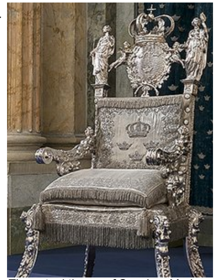
The actual throne of Sweden. Made

Sweden is a constitutional monarchy, ie the king has a ceremonial role only. He opens the parliament, chairs a foreign committee of parliamentarians and informational cabinet meetings, receives ambassadors and goes on state visits. He holds a Christmas speech and one if there's a special crisis (there was a King's speech during the pandemic). The Swedish king used to have a lot of power, but it eroded from the mid 19th century and on. When the king's at that time promised to for Queen Kristina in 1650 and used help the Danes in the Preussian-Danish war in 1864 it was stopped by the for opening the parliament until 1974.