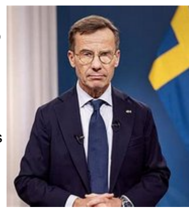
PM Ulf Kristersson speaks to the nation about the gang wars.

The police should definitely be reformed. My impression is that they are focused on the wrong things and often lazy, just picking low hanging fruits for their statistics. I've seen numerous stories of crimes written off for "having no