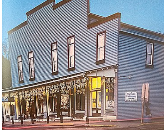
come from an old Stockholm, Minnesota, famous for their Stockholm Pies! <a href="https://www.stockholmpie.com/famous-pie/">https://www.stockholmpie.com/famous-pie/</a> This is the pie HQ, I believe.

These vagabond shoes, are longing to stray... And with this we finish this geographical excursion.